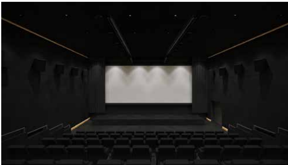
Studio FAMU Reference projection